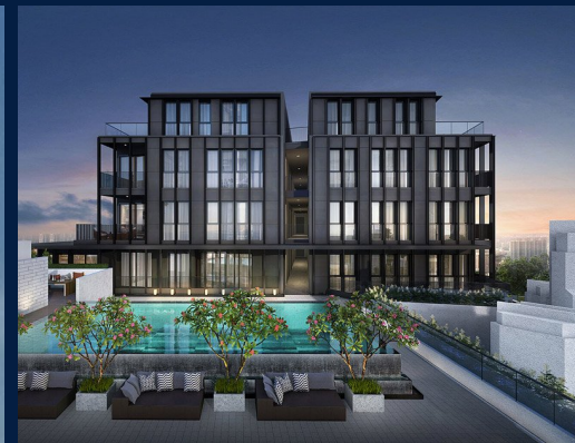
4 - Bedroom